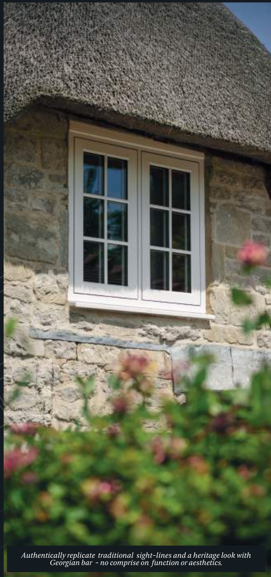
Authentically replicate traditional sight-lines and a heritage look with Georgian bar - no compromise on function or aesthetics.

For most homeowners, the style of their property will inform the design choices they make, so if you live in a Conservation Area Residence 9 can help enhance both appearance and performance, we have proven experience in helping to restore the original character of properties in hundreds of Conservation Areas, always with an eye to any planning considerations. We have also been approved in a number of Grade II Listed properties. If you are in a location with more design freedom R9 can help bring your ideas to life, balancing design and practicality to enhance your home, whilst still maintaining traditional looks.